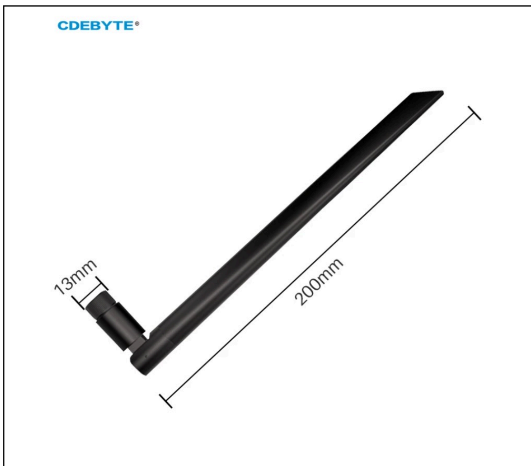
Manufacturer Supplied Product Photo